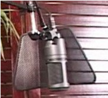
Pop filter in front of microphone

One of the other things you see here in the picture is what's called a pop filter, and there are all kinds of pop filters on the market. I like this wire mesh one and it's the one I recommend. Here's a little experiment you can do. Put your hand in front of your mouth and say the word "pop." When you do, you're going to feel a little burst of air coming from your speech. And when that burst of air hits a microphone, it can make a distorted sound. It's called popping the microphone.