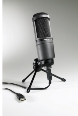
A consumer headset microphone and The Audio Technica 2020 Studio Large Diaphragm USB Microphone

There's a reason for pro audio and there's a reason for consumer audio.